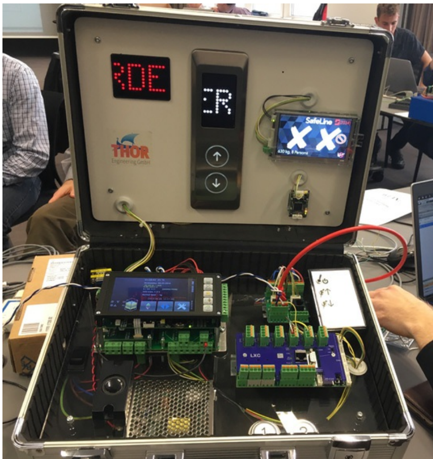
CANopen Lift controller and units in one box connected to car drive units from other companies

As usual, the CANopen Lift community has organized a plugfest to test devices on CiA 417 interoperability.