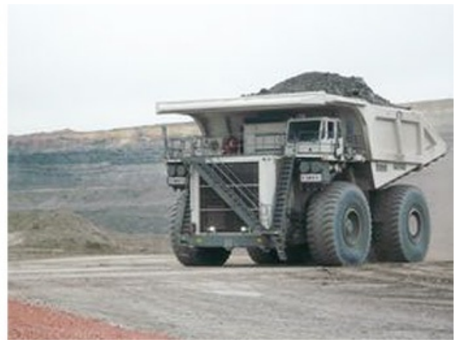
The modules can be installed directly at the signal source e.g. on a dump truck

The electronic system of the I/O module is packed in an IP66-rated aluminum casing protecting it from dust and water. Operating temperature can range from -40 °C to +85 °C. The modules can be installed directly at the signal source, installation of an additional switching cabinet is not necessary. Typical applications include construction machinery, cranes, off-road and heavy-duty vehicles, tractors, combine harvesters as well as wind and solar power plants.