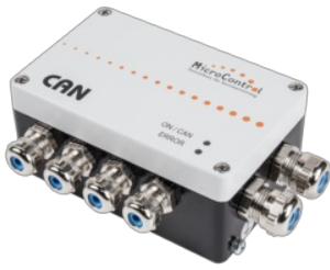
\mu CAN-Box I/O modules offer CAN FD connectivity

Microcontrol enhanced the \mu CAN-Box I/O modules. The eight-channel digital I/O module supports dynamic CANopen FD PDO (process data object) mapping.