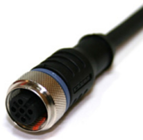
Version with straight connector